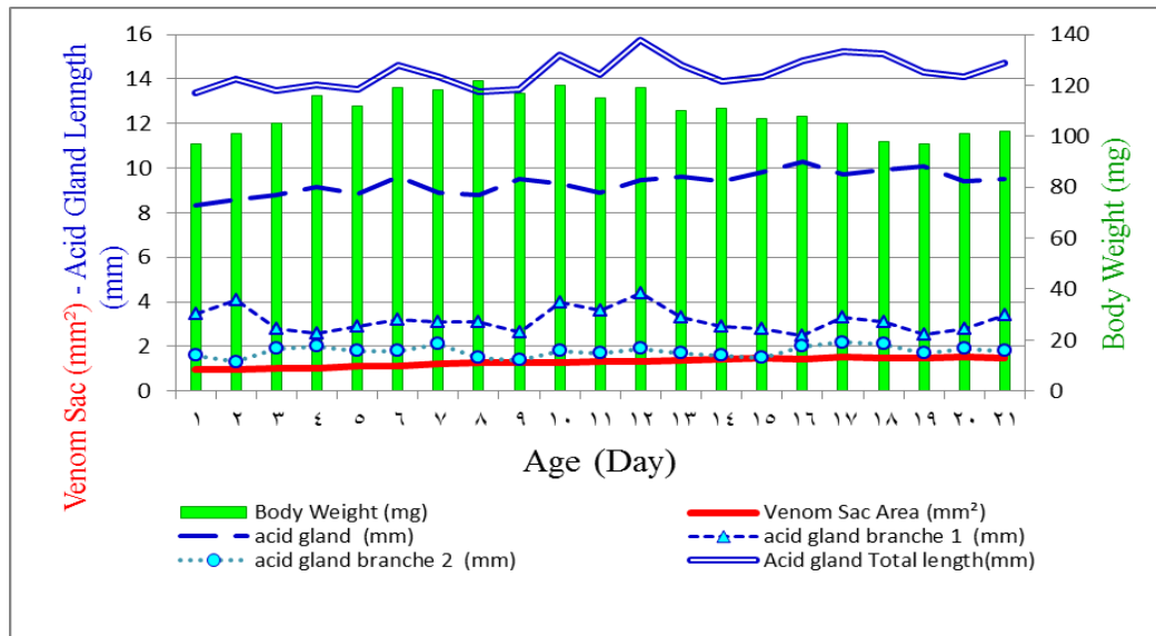
Fig.1. Effect of different ages of honey bee workers on venom glands parameters in spring season