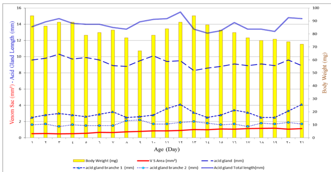
Fig. 4. Effect of feeding honey bee workers with one bee honey comb and another one empty on venom glands parameters in autumn season