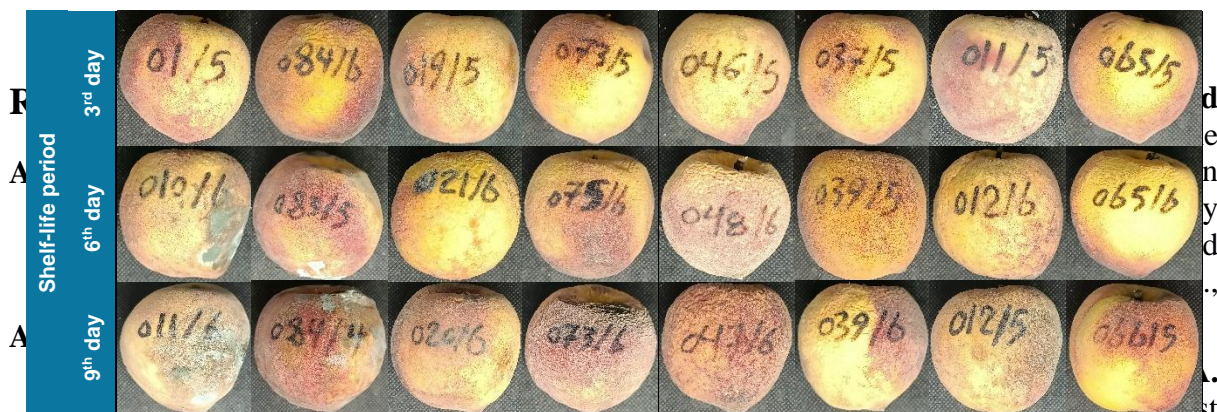
Fig. 2. Effect of chitosan coating on shelf-life of beach fruit cv. "dixired" treated with stage and some postharvest treatments on quality of beach fruit cv. "dixired" Bot., 41 (1): 343-357.