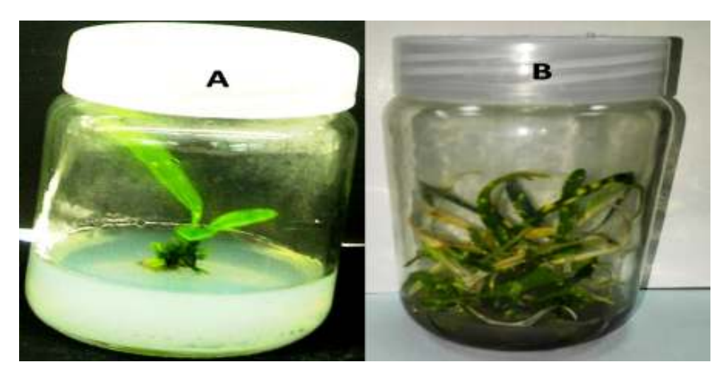
Photo (2): Codiaeum varigatum shoot proliferation and growth as affected by control treatment (without GA<sub>3</sub>, A) and the best GA<sub>3</sub> concentration (4.0 mgl<sup>-1</sup> GA<sub>3</sub>, B) combined with 4.0 mgl<sup>-1</sup> kin+0.4 mgl<sup>-1</sup> NAA during elongation stage 12 weeks.

Means having the same letter(s) within the same column are not significantly different according to Duncan's multiple range test at 5% level of probability.